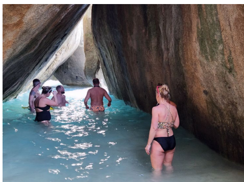
Caves at "The Baths" Virgin Gorda