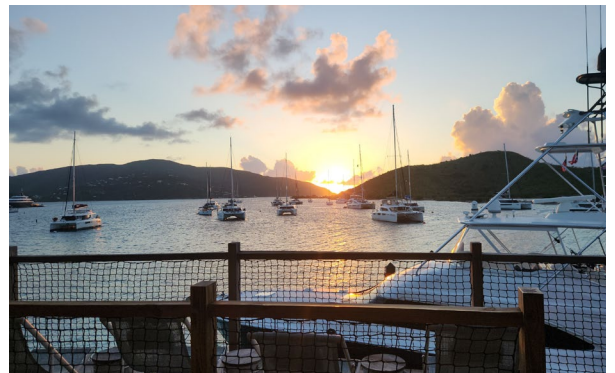
Saba Rock Bar and Restaurant Sunset