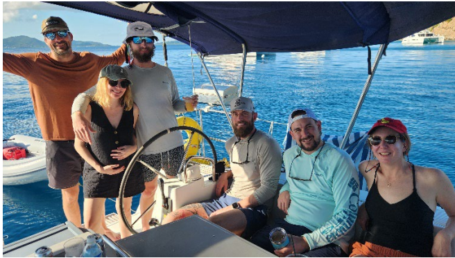
March 24 Charter Party, Coopers Island Beach Club

Some photos from some of our recent BICS Sailing Charter Vacations.