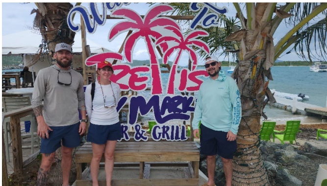
Trellis Bay Bar and Grill, Tortola