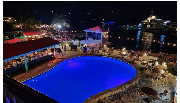
Stilt Dancers at the Leverick Bay Resort & Marina