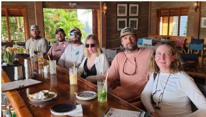
Bitter End Yacht Club Bar, Virgin Gorda, BVI