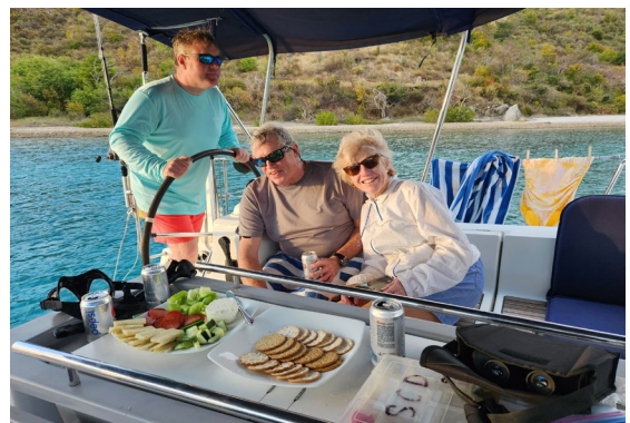
Crudit  served onboard, Norman's Island BVI