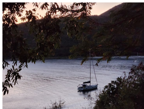
Our boat at Brandywine Bay, Tortola