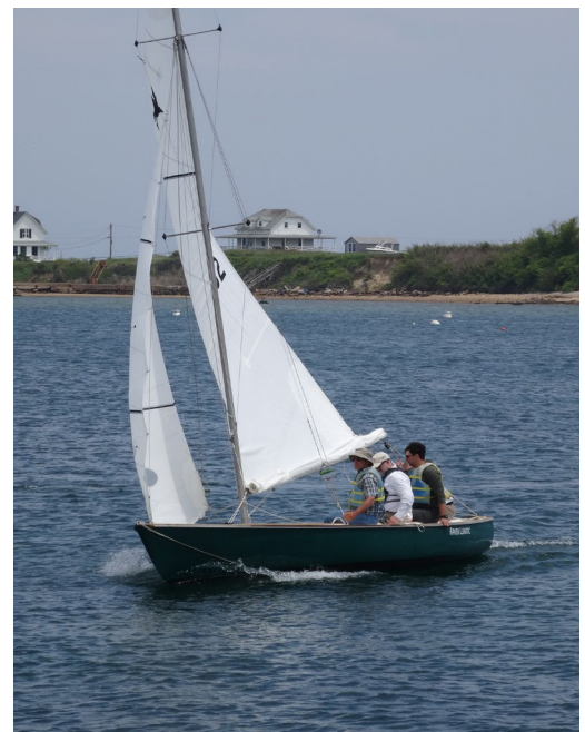
Raven Lunatic, one of our sail training vessels underway in the GSP