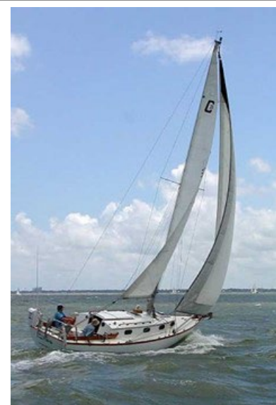
BICS "Mischief" on a relaxing sail in BI Sound