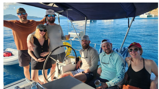
BICS March 10 Bareboat Charter Crew Sailing off Virgin Gorda in the British Virgin Islands