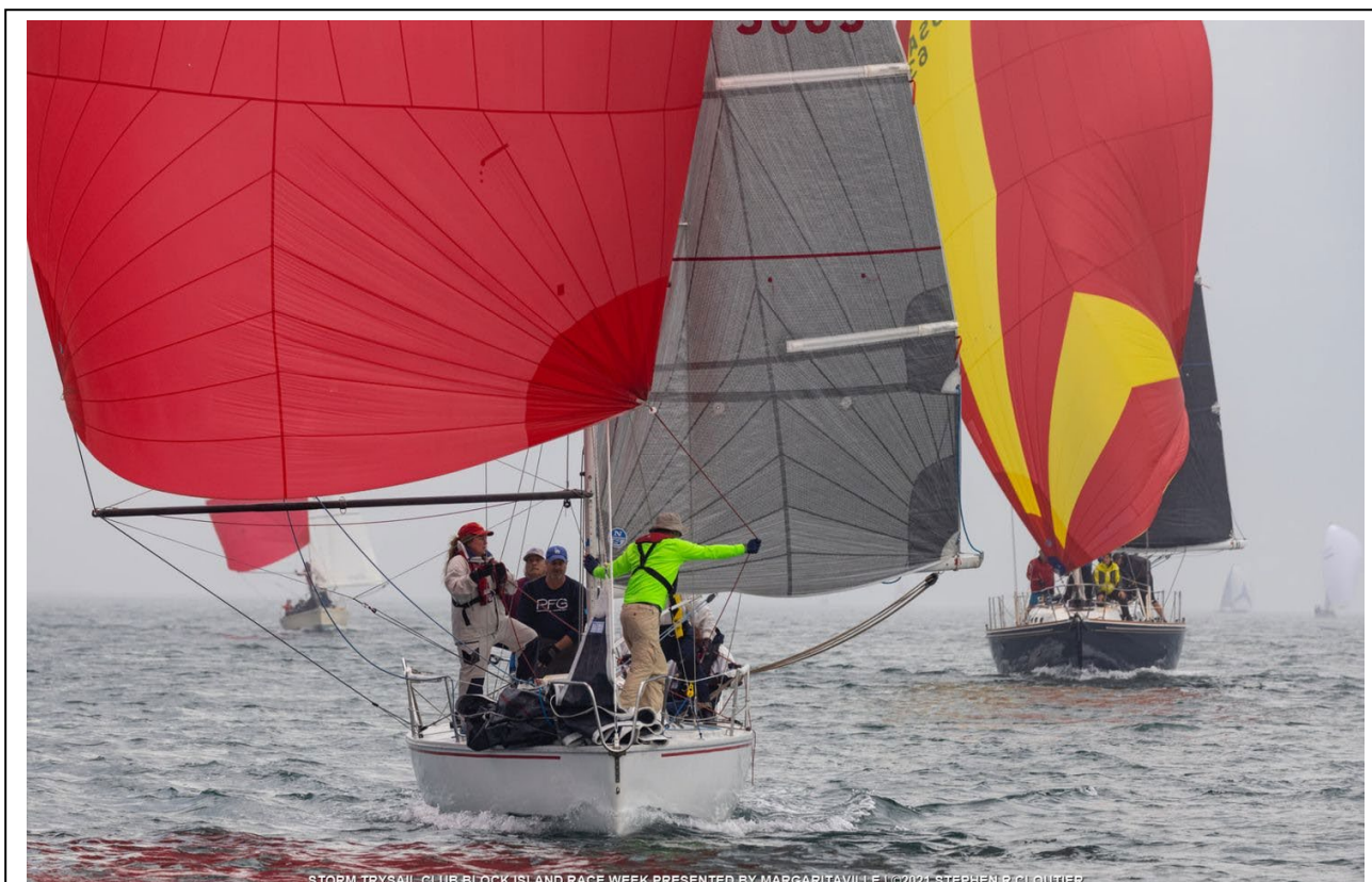
STORM TRYSAIL CLUB BLOCK ISLAND RACE WEEK PRESENTED BY MARGARITAVILLE